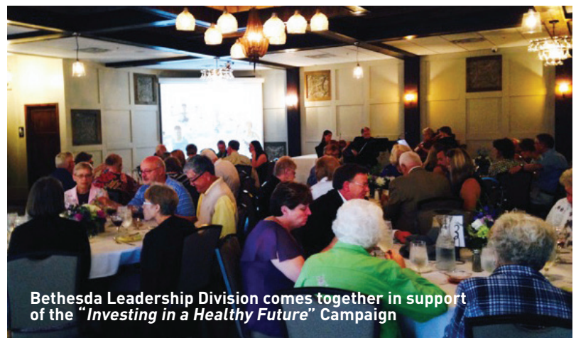
Bethesda Leadership Division comes together in support of the "Investing in a Healthy Future" Campaign

The generosity of many individuals and families in our community is needed if we are to achieve our goal and raise the funds to impact the needs of the people in the communities we serve. Bethesda is committed to continuing to "bring the best" in health care to our communities.