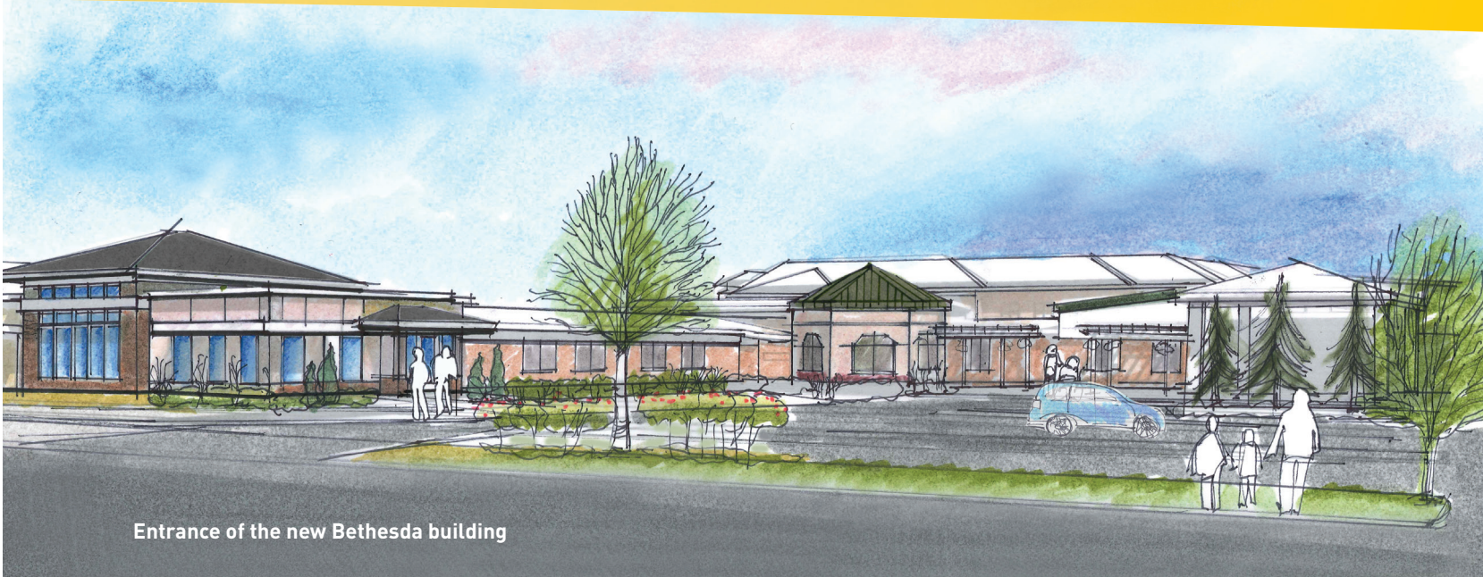
Entrance of the new Bethesda building